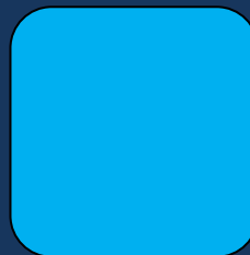
NAZMA SULTANA (O/A)